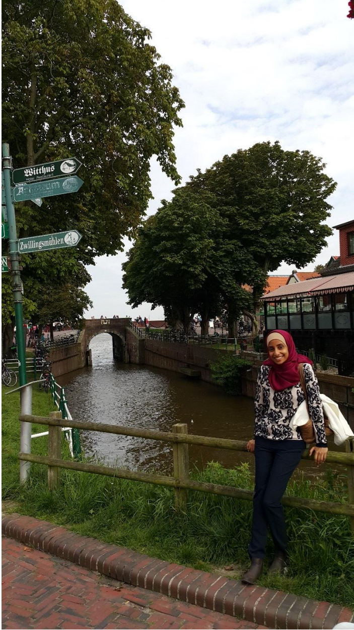
Figure 4: Greininsel