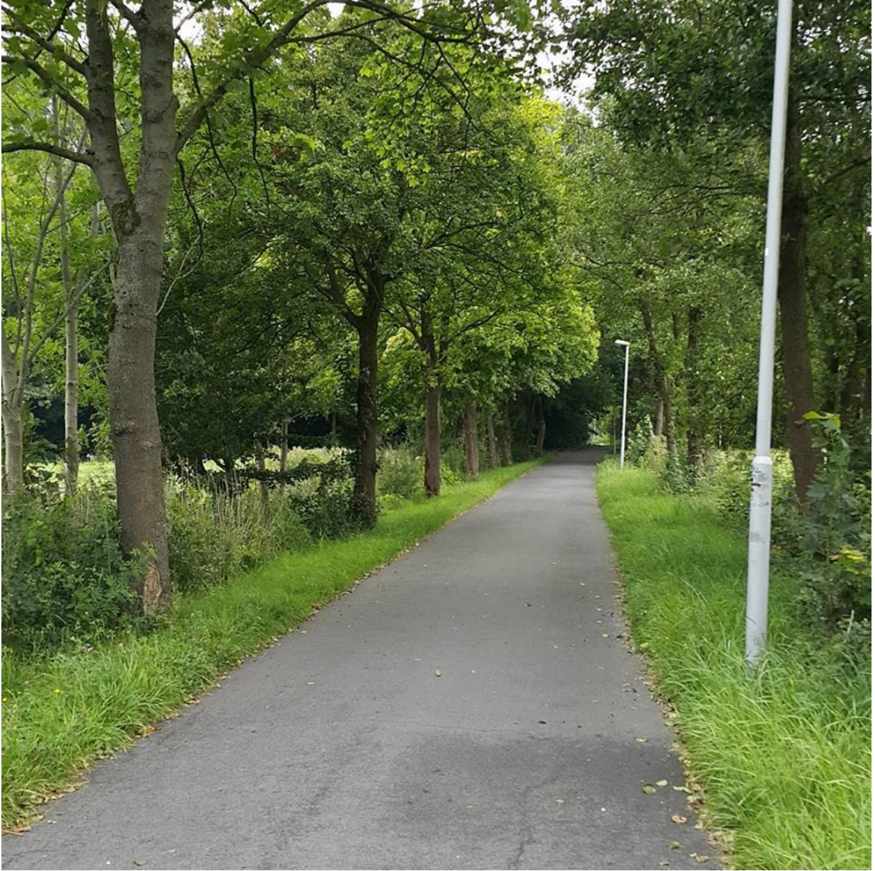
Figure 9: daily road to Jade hochschule