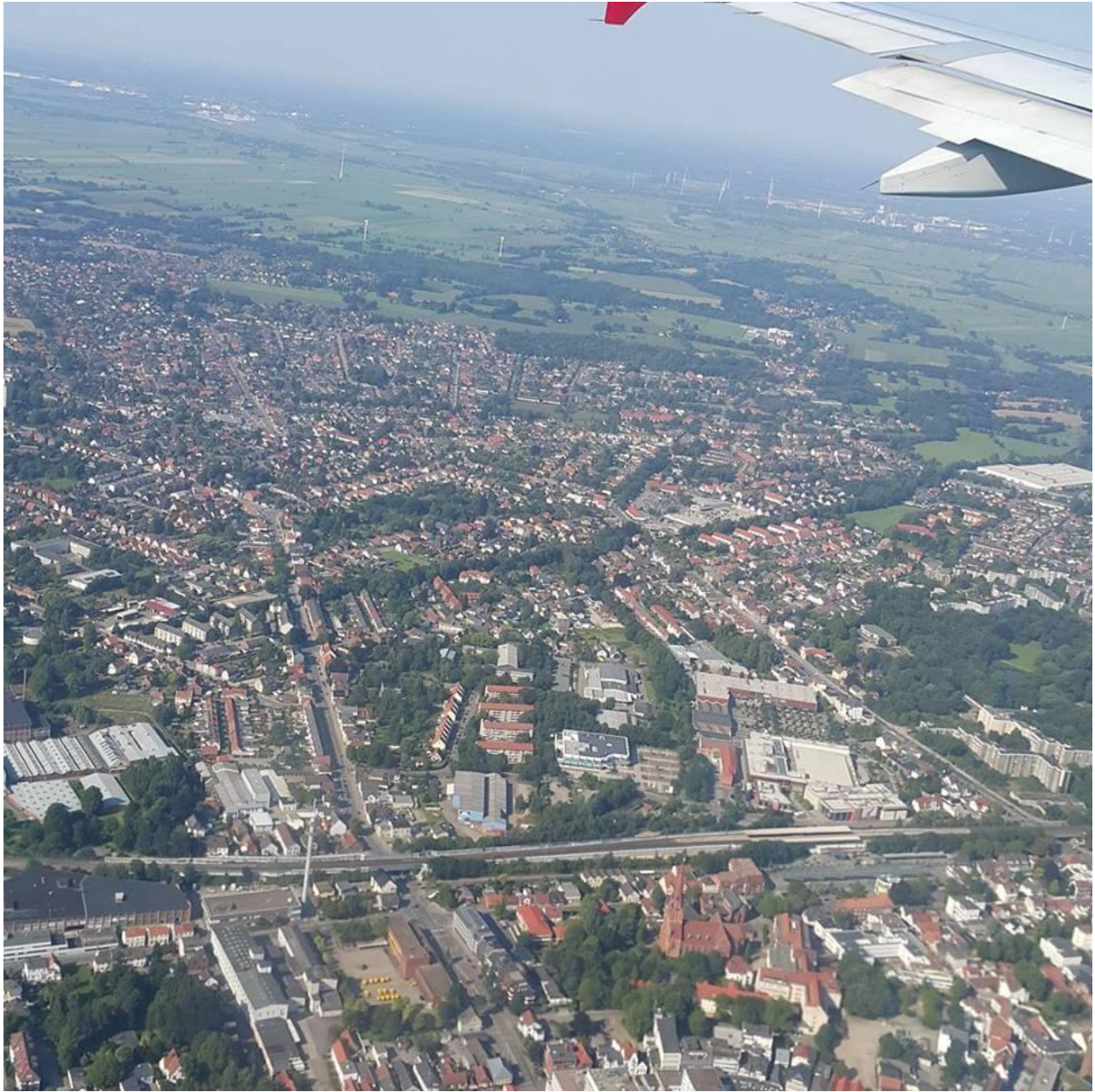
Figure 8: Bremen from the plane