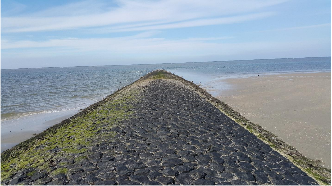
Figure 1 Baltrum island