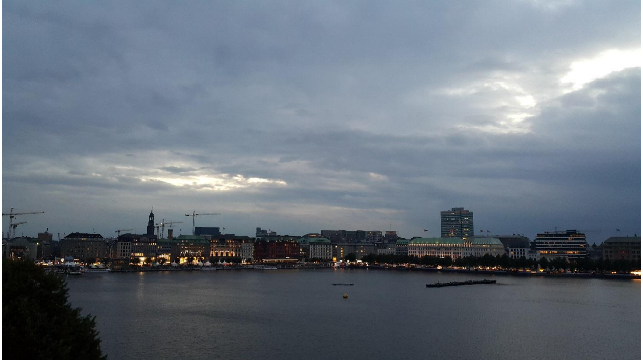
Figure 6: Hamburg