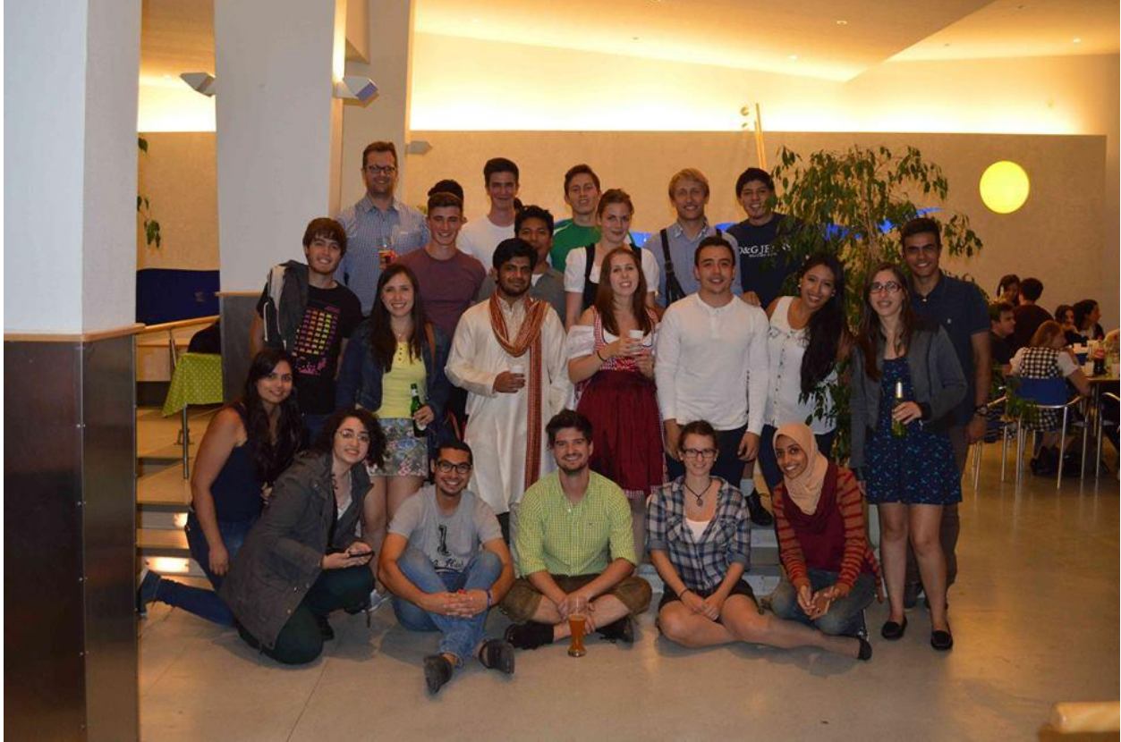
Figure 12:International dish day