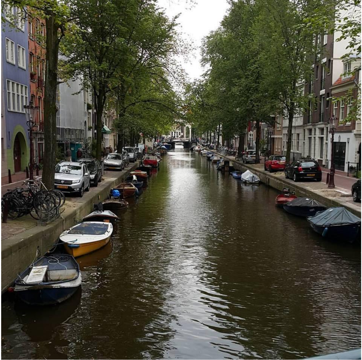
Figure 10: Amsterdam