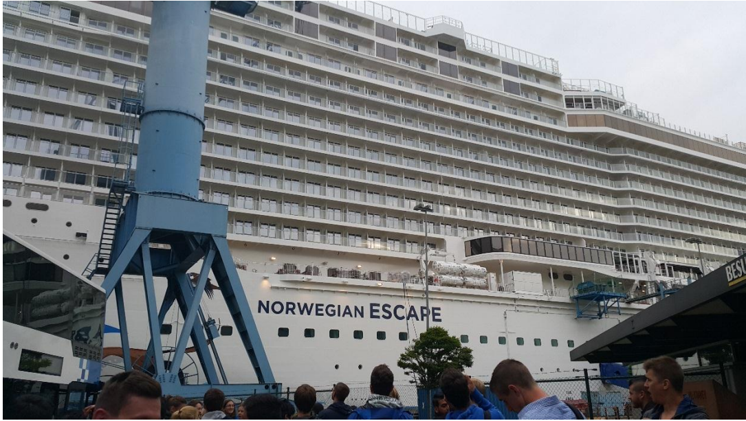
Figure 3: Meyer Wreft Factory