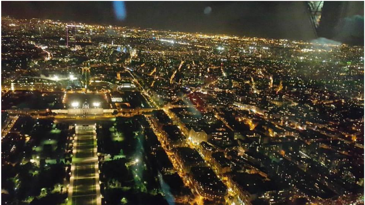
Figure 7: Paris city from the top of Eiffel Tower