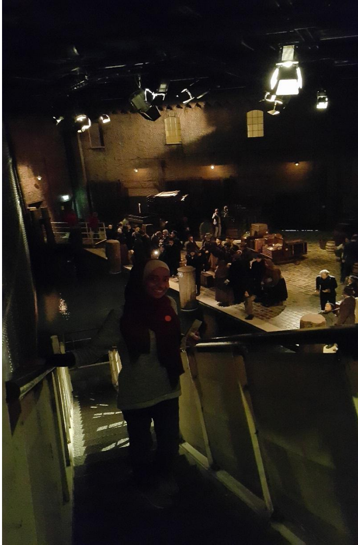
Figure 5: Bremenhaven Immigration museum