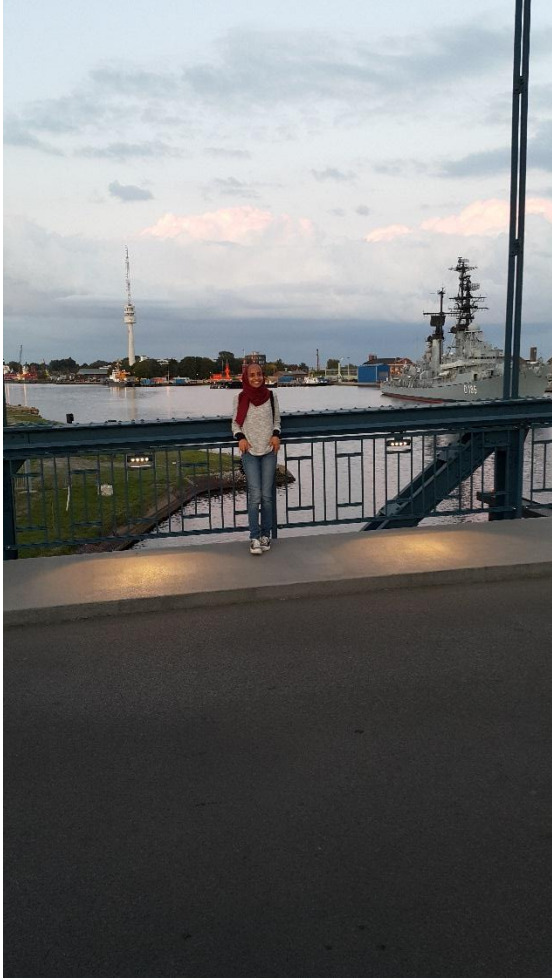
Figure 2: Kaiser wilhem Bruke