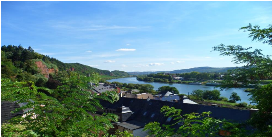
Figure 1: Trier general view

I would like to thank the German Academic Exchange Service (DAAD), and German Jordanian University and Trier University of Applied Sciences, for giving me the chance to participate in the Train the Trainer program. I really appreciate the committee of Train the Trainer program 2015 for their help and cooperation.