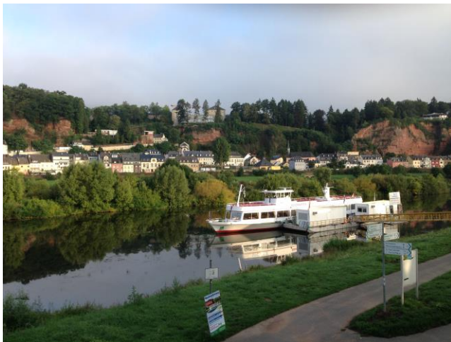
Figure 2: Mosel River