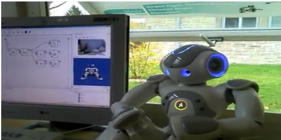
Figure 5: Robotics Lab