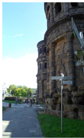
Figure 3: Porta Nigra