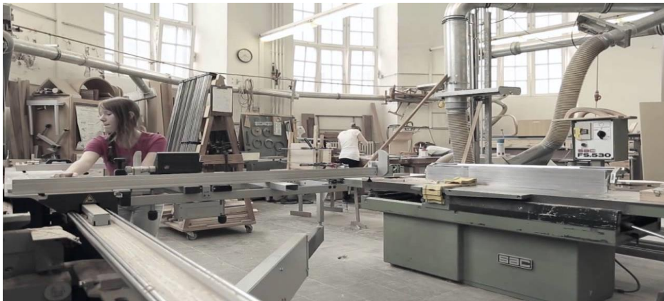
Figure 4: the workshop