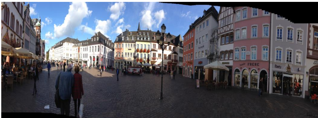
Figure 6 Trier City Center

This experience is very rich and different, new environment, different county, and nice people, I discovered a lot and learned a lot, this training entrenched me on the personal level too.