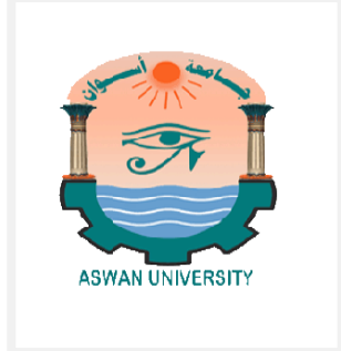
Aswan University (AU)