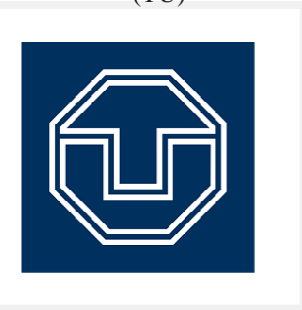
Technische Universität Dresden (TUD)