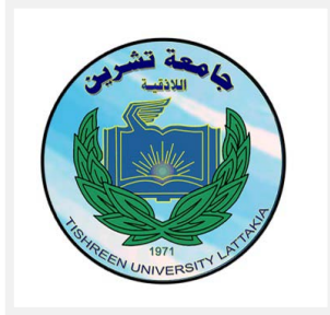
Tashreen University (TU)