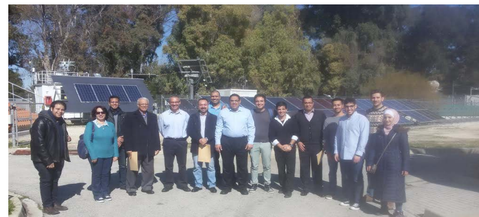
Nicosia Capacity Building Training (13 th -24 th of February, 2017)