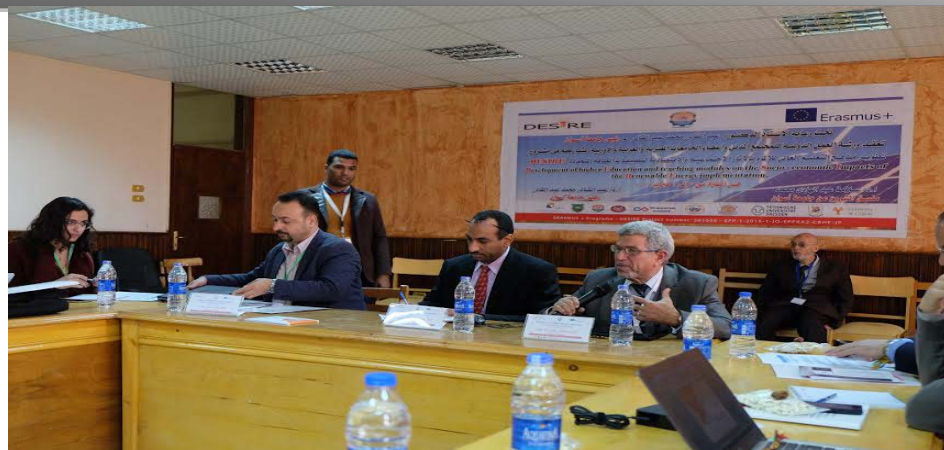
3 rd DESIRE Management Meeting at Aswan University on Feb. 7

The fourth Desire Project meeting hosted by Dresden University, Germany.