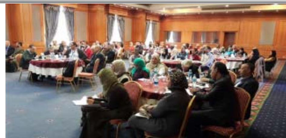
Aswan Dissemination Workshop on Feb. 8