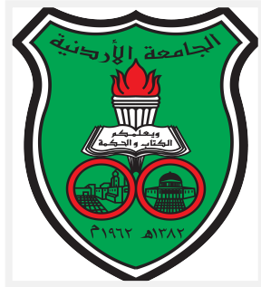
University of Jordan (UJ)